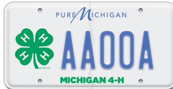
Draft plate; not final version.